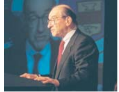
Federal Reserve Chairman Alan Greenspan

The Senator said he would introduce legislation that would protect workers in 401(k) plans against employer pressure to buy company