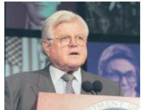
Senator Edward Kennedy