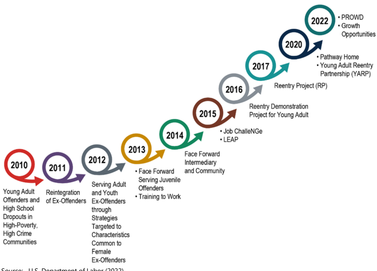
Exhibit 1. U.S. Department of Labor grant initiatives supporting reentry programming from 2010 to 2022