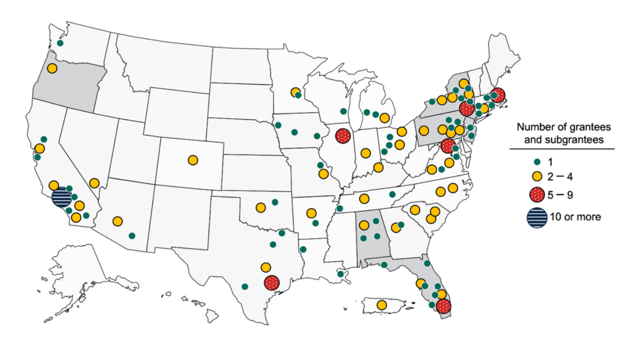
Exhibit 2. Locations of 2017–2019 Reentry Project grant programs

Note: States shaded in darker grey were included in the Reentry Project impact study.