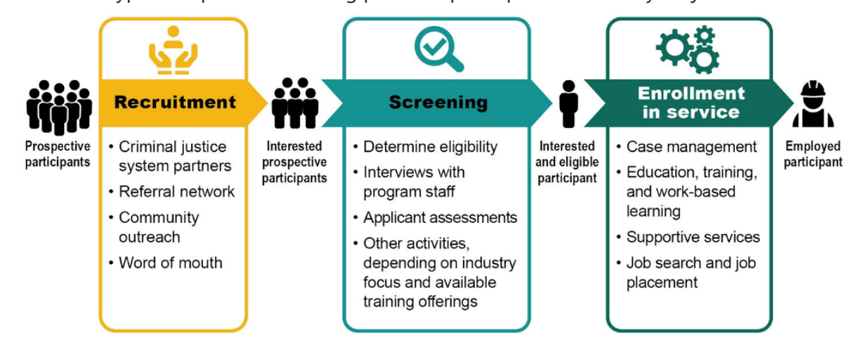
Exhibit 3. Typical sequence for linking potential participants to Reentry Project services