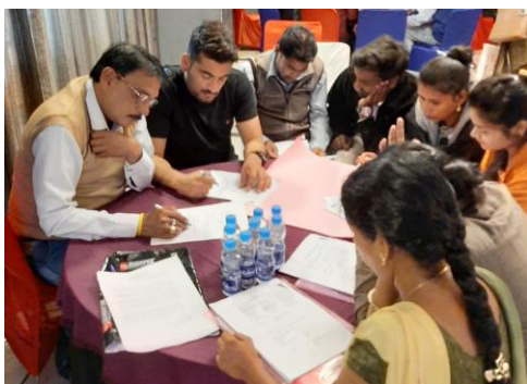
Group discussion on child labour survey format of the government held in Chhattisgarh, India.