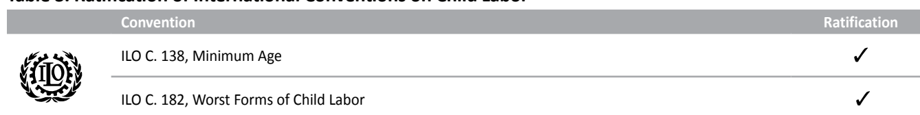
Table 3. Ratification of International Conventions on Child Labor

Uzbekistan has ratified all key international conventions concerning child labor (Table 3).