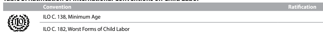
Table 3. Ratification of International Conventions on Child Labor

Tuvalu has ratified one key international convention concerning child labor (Table 3).