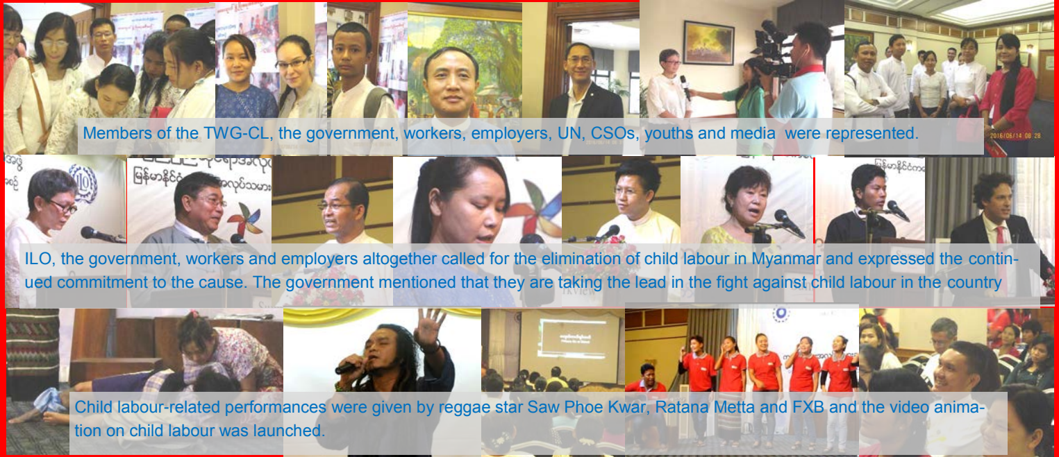
Members of the TWG-CL, the government, workers, employers, UN, CSOs, youths and media were represented.

ILO, the government, workers and employers altogether called for the elimination of child labour in Myanmar and expressed the continued commitment to the cause. The government mentioned that they are taking the lead in the fight against child labour in the country