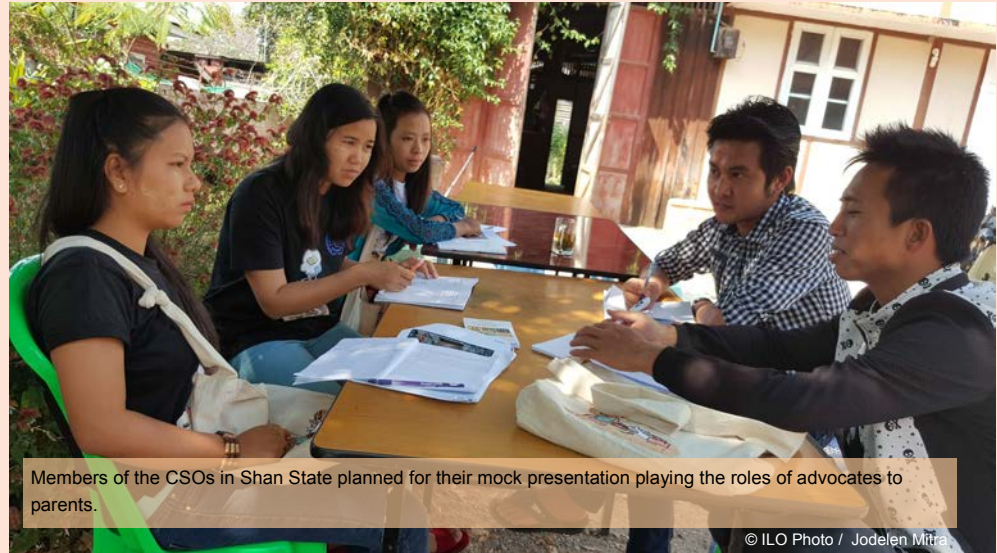
Members of the CSOs in Shan State planned for their mock presentation playing the roles of advocates to parents.