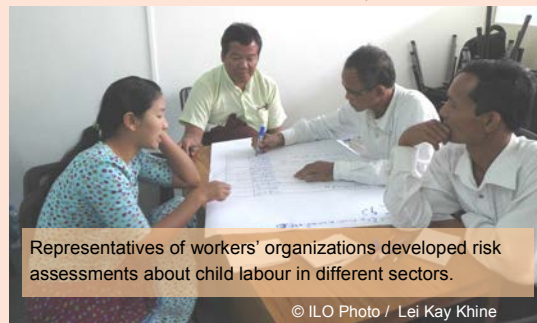
Representatives of workers’ organizations developed risk assessments about child labour in different sectors.