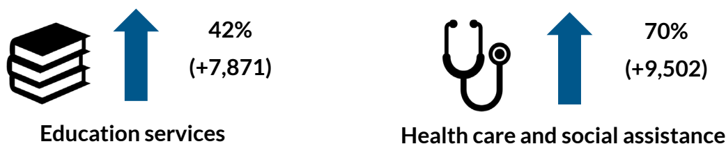
FIGURE 3 National Increases in the Number of Registered Apprentices in Select Nontraditional Industries from 2019 to 2022

Although states expanded apprenticeship programs to nontraditional industries, such as information technology and health care prior to the pandemic, state administrators described accelerating expansion during the COVID-19 pandemic in response to employer demand and staffing shortages. 20 According to RAPIDS, nationally, from 2019 to 2022 the number of active registered apprentices increased in several nontraditional industries, including education and health care and social assistance (figure 3). Three state staff noted that the pandemic accelerated their expansion into health care and education because of the increased nursing and teacher shortages resulting from the pandemic. One state administrator noted, “We have seen a big decline in the [jobs in the] health care industry during COVID because of the strain put on the health care system, the nurses, the doctors, but it also demonstrated our need to reach out and grow new apprenticeships in health care.”